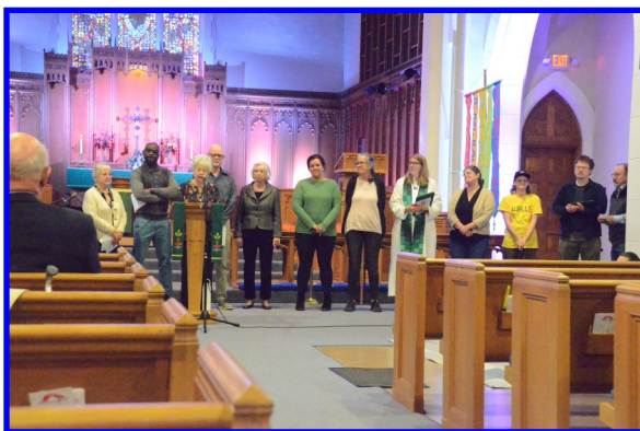
Pastor & Staff Appreciation was celebrated on October 27th.