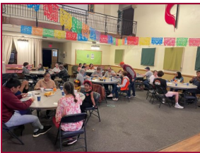
Dia de Muertos Celebration November 2, 2022

December 21st: Pizza Night with Holiday Party! Join us for Christmas Cookie Decorating, Ornament Making, Crafting - maybe even some Christmas Caroling!