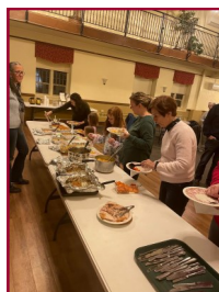
Thanksgiving Dinner! November 16, 2022