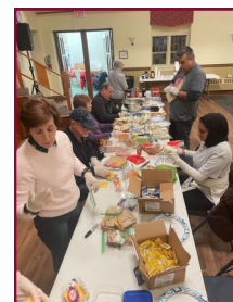
Sandwich making to fill community fridge We made 138 sandwiches.