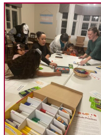
Gratitude activities in partnership with The Perch