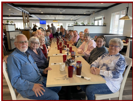
The NDY Group met on Friday, April 28th at Mother's Restaurant in Aurora.