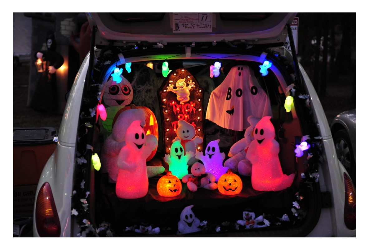
TRUNK OR TREAT - October 29th, 12:30pm - 2:30pm (Volunteers needed 12pm - 3pm)

Sunday, October 29th please come out for a family-friendly Trunk-or-Treat. Food, games, and candy are provided!